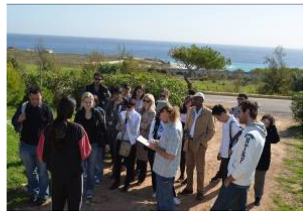
Above left: the class during a role playing session in negotiation skills and